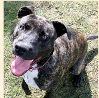
Lacey: Sponsored Doggie

More information on Lacey and on K-(9 Rescue can be found at: www.k9dogrescue.com/