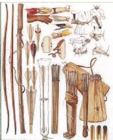
A Medieval Archer's necessary accoutrements.