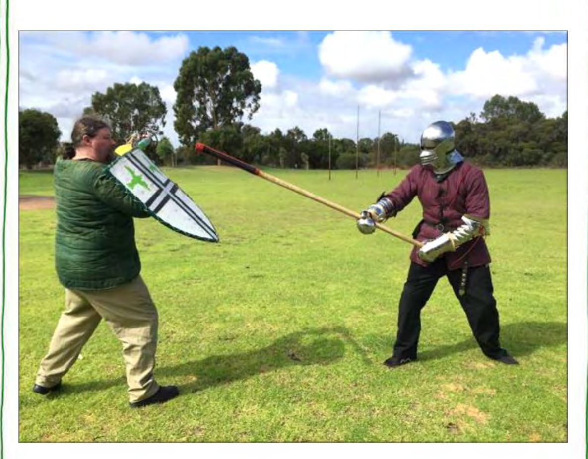
Photograph by Liduina de Kasteelen van Valkenburg